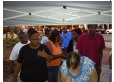
MHA residents signing up to take part in the initiative.